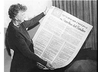
Eleanor Roosevelt with the Universal Declaration of Human Rights