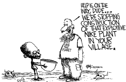
Political Cartoon critiquing "naïve" anti-globalization advocates

The U.S. as a society has established a system of vigilance to mitigate capitalism: